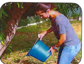
Drain & dump any standing water.