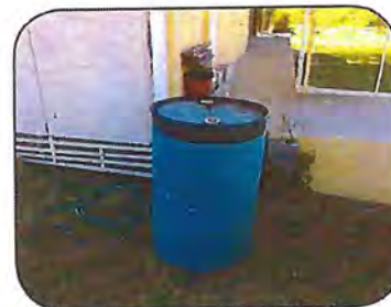
Keep rain barrels covered tightly.