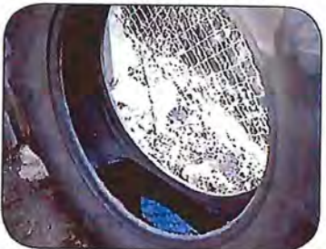
Recycle used tires or keep them protected from rain.