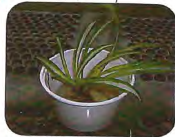
Put plants in soil, not in water.