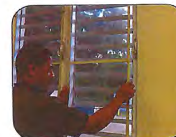
Install or repair window & door screens.