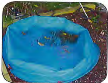
Drain water from pools when not in use.