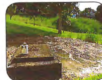
Keep septic tanks sealed.