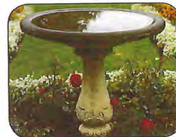
Weekly, empty standing water from fountains and bird baths.